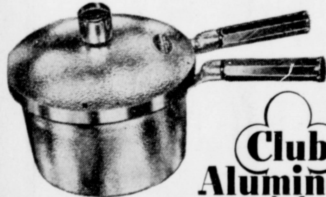
It's a "Club Aluminum" product, so it has to be good!