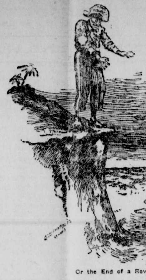
Or the End of a Revolution.