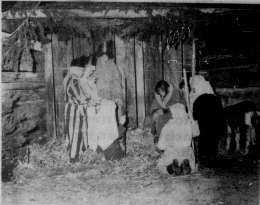
Assembly of God Nativity Scene

the Jubilee will entertain with "The Twelve Days After Christmas" and "Auld Lang Syne". They will lead the group in the singing of Carols.