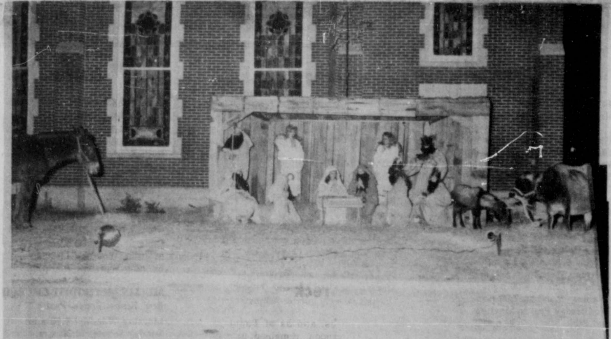
First Baptist Nativity Scene

The public is invited to a singing at Ridge Community Center New Year's Eve night, December 31st. There will be a stew supper. Come at 6 p.m. and bring your bowl and spoon.