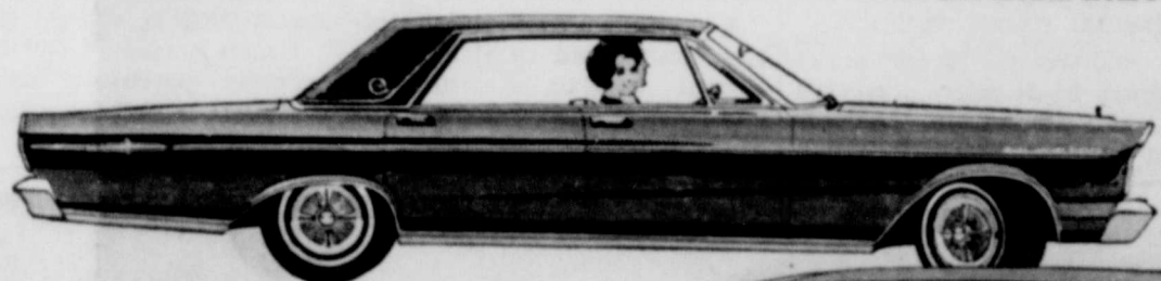
FORD GALAXIE 500 LTD 4-DOOR HARDTOP

5 new Ford Wagons—including Country Squires and Country Sedans with new dual facing rear seats, ideal for families up to 10. See all the new models from Ford at your Ford Dealer's soon!