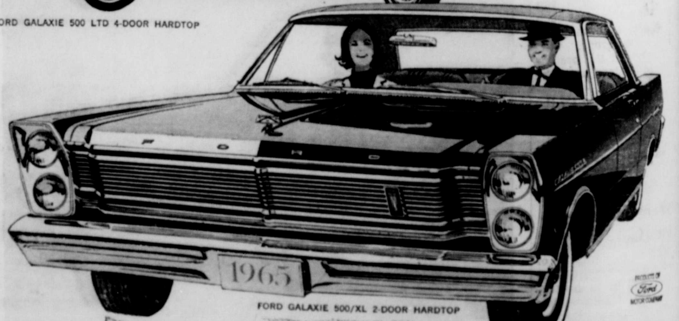
FORD GALAXIE 500/XL 2-DOOR HARDTOP

Test drive Total Performance '65...BEST YEAR YET TO GO FORD