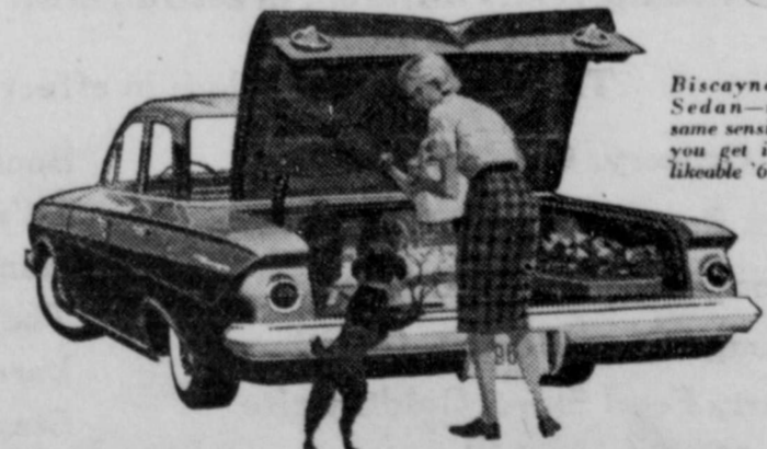
Biscayne 4-Door Sedan—with the same sensible design you get in all the likeable '61 Chevies.

For big-car comfort at small-car prices Biscaynes—6 or V8—give you a full measure of Chevrolet quality—yet they're priced down with many cars that give you a lot less! '61 CHEVY BISCAYNE 6 The lowest priced full-sized Chevy!