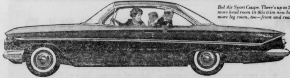
Bel Air Sport Coupe. There's up to 2 inches more head room in this trim new hardtop; more leg room, too—front and rear.