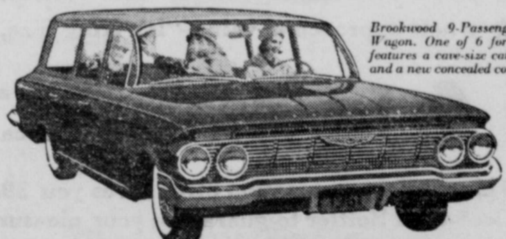
Brookwood 9-Passenger Station Wagon. One of 6 for '61. Each features a car-size cargo opening and a new concealed compartment.

This '61 is built on the principle that the place you want space is inside . We put it there, too. Actually trimmed the outer size to give you extra inches of clearance for parking and maneuvering, and still worked wonders with inner space. Door openings are as much as 6" wider. Seats as much as 14% higher. We've thought of everything. Increased rear foot room by slenderizing the driveshaft tunnel. Worked in sensible new ideas all the way back through that huge bin of a baggage compartment. See how thoughtful this one is? Full of good new things. Full of good old things, too, like Chevrolet's well-known thrift and dependability. See it soon.