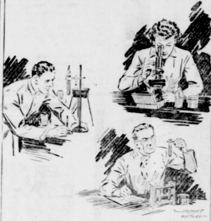
FOR MANY YEARS, DEDICATED RESEARCH DOCTORS HAVE LABORED UNKNOWN IN MEDICAL RESEARCH LABORATORIES, FIGHTING AGAIN AND AGAIN, UNTIL ONE DAY THEY LEARNED HOW TO KILL THE GERM OR THE VIRUS THAT MIGHT POSSIBLY HAVE KILLED YOU.

UNTIL A RESEARCH EXPERT OF THE U. S. PUBLIC HEALTH SERVICE PEERED THROUGH A MICROSCOPE EARLY IN 1922, ROCKY MOUNTAIN SPOTTED FEVER WAS A RUNAWAY KILLER DISEASE. THROUGH THE EYE OF HIS MICROSCOPE HE WATCHED A CARRIER TICK WIGGLE AND SQUIRM. THEN HE GENTLY SQUEEZED A DROP OF EXPERIMENTAL VACCINE ON THE SLIDE — AND DEATH LAY DEAD.