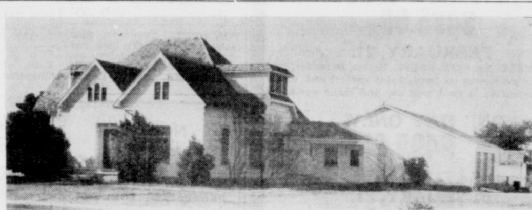
EXTERIOR VIEW OF THE ROY WILKINS FUNERAL HOME.