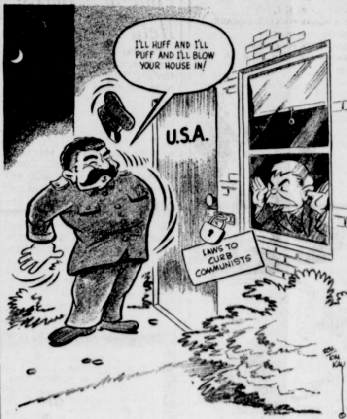
That Big, Bad Wolf