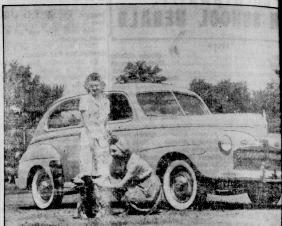
If, as salesmen assert, the woman generally has the last word in selecting a new car, the Ford for 1942 is due for a big year. A new "high" in feminine appeal is achieved in the '42 Ford lines, with long graceful fenders, and flowing streamlines combined with a lower bodied boards are entirely concealed. This Ford Super DeLuxe Tudor Sedan, DeLuxe and DeLuxe lines are equipped with either the famous V-8 or advanced 90-horsepower "six."

Rudolph Ethridge called on Ashley Weathers Wednesday.