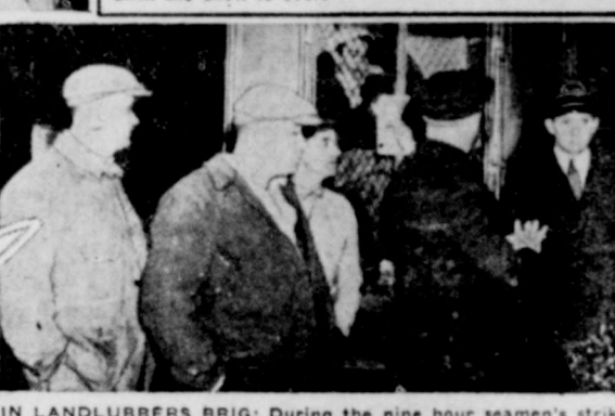
IN LANDLUBBERS BRIG: During the nine in New York, two instigators were arrested a "Black Maria." This strike caused very lit and few cases of violence were registered. d and toted away in the little delay in thippi