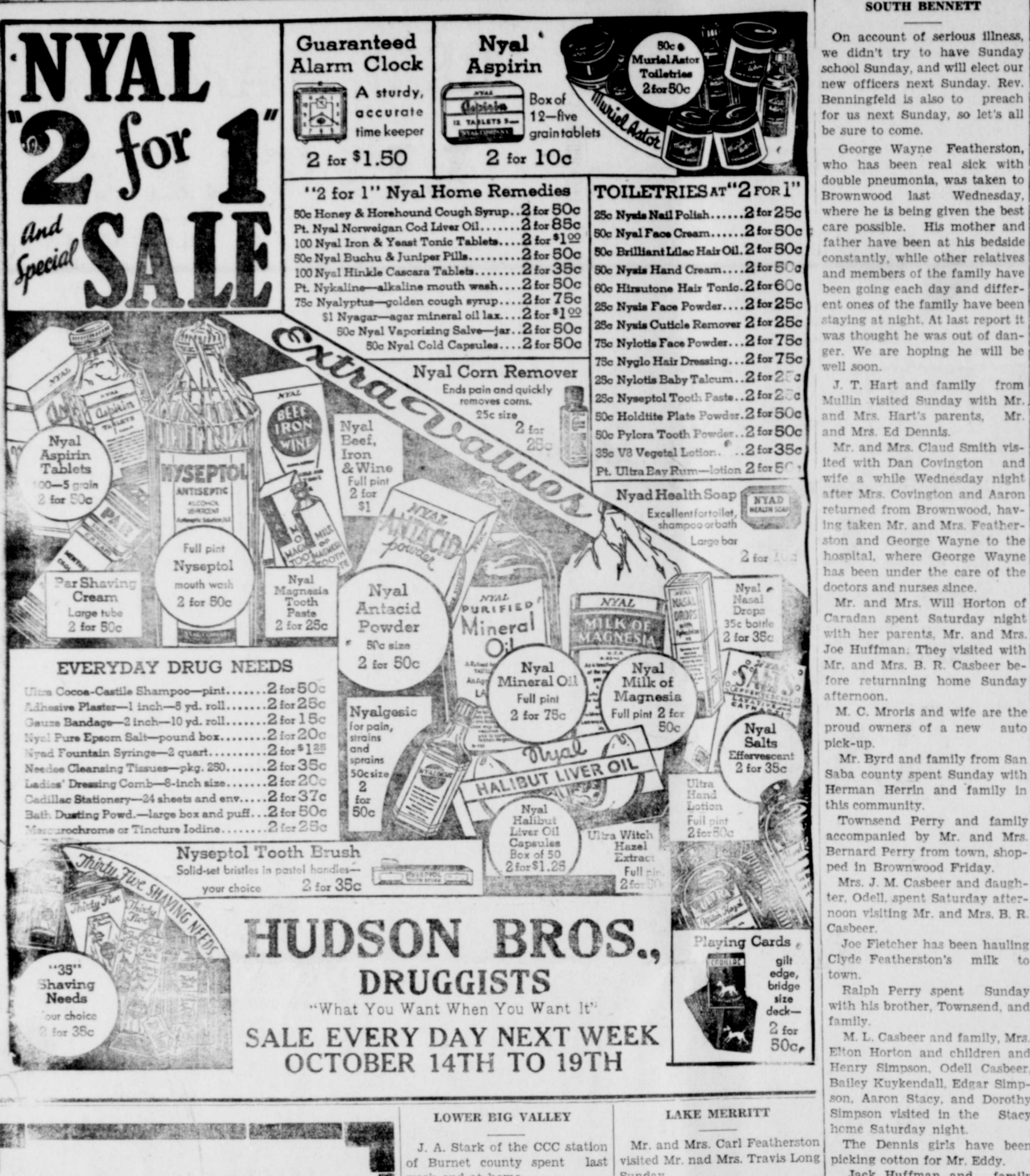
THE GOLDTHWAITE EAGL E-OCTOBER 11, 1935.