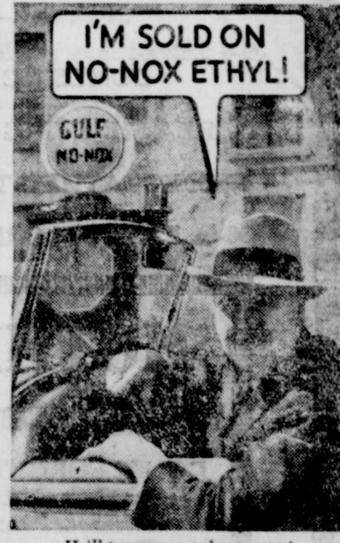
He'll pay more and get more!