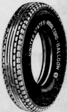
United States ROYAL CORD Balloon

It's all in the strong yet flexible Latex-treated Web Cord construction—Sprayed Rubber—Flat Band Building—a tread design that set the pace for the whole industry. It's worth learning the whole story. Come in and we'll tell you. No obligation of course.