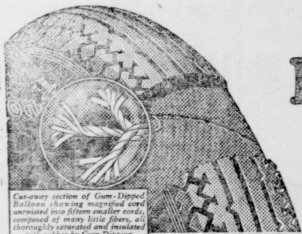
Cut-away section of Gum-Dipped Balloon showing magnetized cord untreated into fifteen smaller cords, composed of many little fibers, all thoroughly saturated and insulated with rubber by Gum Dipping.

Car owners have never been able to buy tire mileage at so low a cost per mile as they can buy Firestone Gum-Dipped Tires today. And never before have they been able to buy tires so comfortable, safe and trouble free.