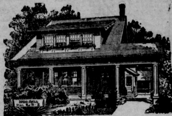
One of a hundred home plans

If you need a new top, see us.—City Garage.