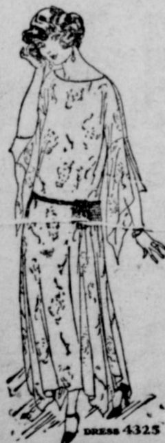
DRESS 4325 PATTERN & DETAIL is provided for this BUTTERICK DESIGN including instructions for Making Girdle and Ornament.