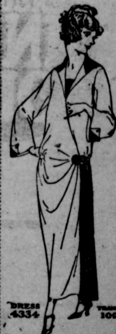
DRESS 4334 PATTERN & DETAIL is provided for this BUTTERICK DESIGN including instructions for Making Ornaments.

EVERY MAN'S DESIRE FOR WARM WEATHER IS HAVING GOOD FOOT COMFORT. AND THAT MEANS WEARING HOSIERY THAT IS RESTFUL TO THE FEET. SILK OR SILK LISLE SOCKS GIVE THE DESIRED COOLNESS. WE CARRY THEM IN A WIDE VARIETY OF COLORS, GUARANTEED TO GIVE YOU GOOD SERVICE, AND REASONABLY PRICED.