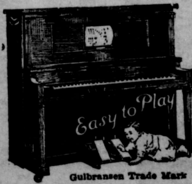
Gulbransen Trade Mark

THE GULBRANSEN IS EASY TO PLAY—AND EASY TO PLAY WELL. YOU'LL BE SURPRISED HOW QUICKLY YOU BECOME SKILLED—HOW SOON YOU LEARN TO BRING OUT THE VERY BEST SOUL OF MUSIC. FOR SIMPLE INSTRUCTION ROLLS EASILY TEACH YOU HOW.