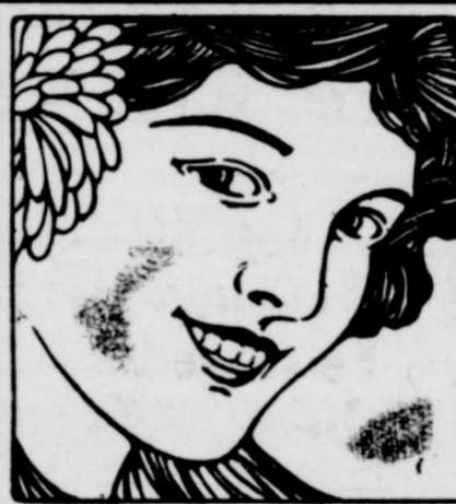
CLEMENTS', The Rexall Store