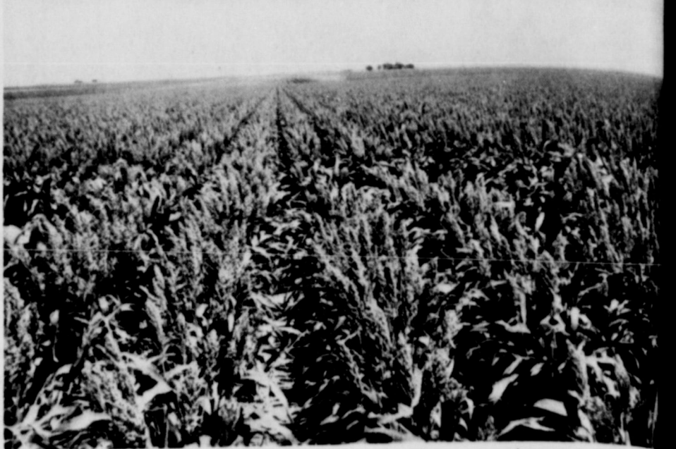
MINIMUM TILLAGE continues to be the fastest-growing conservation practice in the nation being tried on an additional 2.9 million acres of cropland in fiscal year 1976, for a new total of 39 million acres. The practice conserves energy as well as soil and because of its effectiveness and popularity, it is felt by many experts that this practice will be around for years to come. More information can be obtained by contacting the local Soil Conservation Service.

Some of the ladies of the Tahoka Church of Christ packed boxes for the Tipton Orphans Home at Tipton, Oklahoma on Tuesday morning.