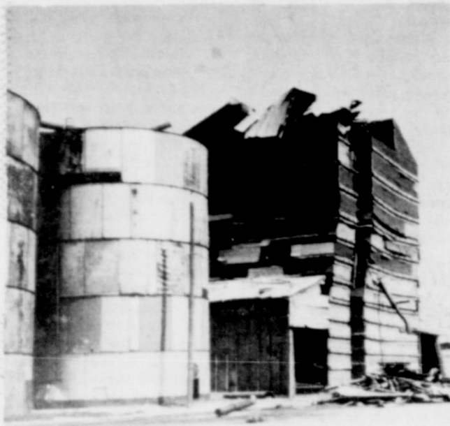
THE OLD ELEVATOR at Tatum Brothers in Tahoka is being demolished. In the picture at the top, a cable is pulling the top section off, and the lower picture shows the debris on the ground.