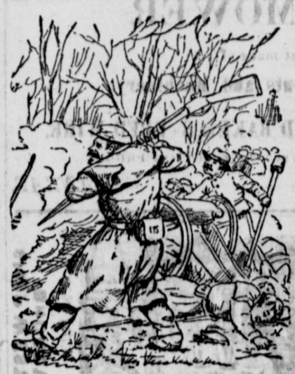
"WE'LL PAY THEM BACK!" ROARED ARKAN- SAW TOM.

Luke's men were falling on every side. The ground was strewn with dead and dying, and the awful work still went on.