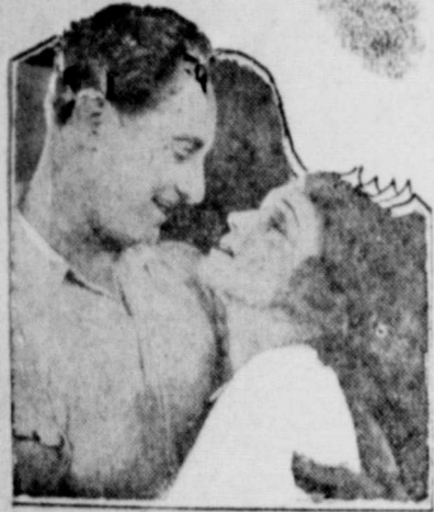
Scene From WANTED IN THE CLOUDS Starring AL WILSON A UNIVERSAL THRILL FEATURE QUEEN TODAY