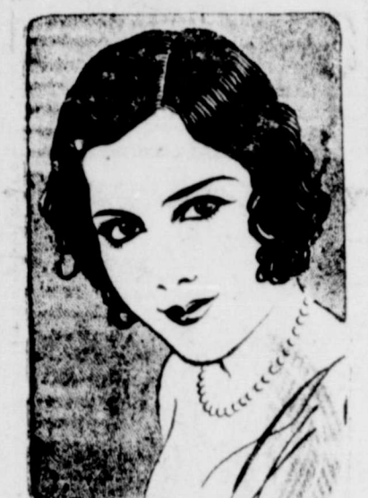
MARY BRIAN IN "UNDER THE TONTO RIM" A PARAMOUNT PICTURE

Gold; Bad Men; Vigilantes, and Thrills in Film at Palace