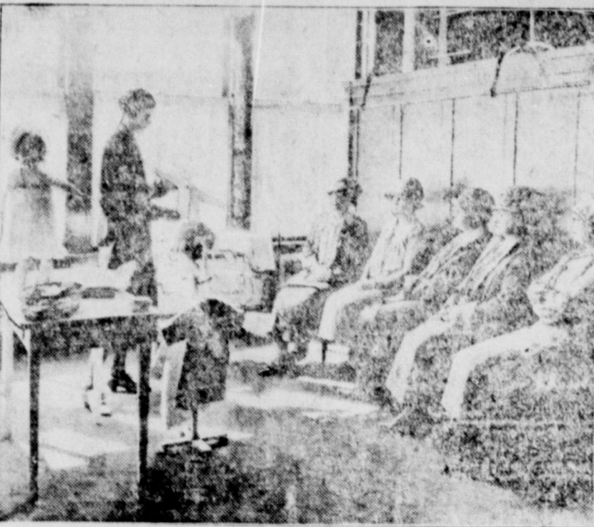
Discussing Children's Clothing at a Home Demonstration Meeting in a Department Store.

(Presented by the Bureau of Home Economics, United States Department of Agriculture.) Extension work for farm women in Illinois has included a number of demonstrations in advantageous buying. The members of a home demonstration group are invited to meet the agent in one of the department stores in the nearest shopping center and are given talks on selecting various kinds of clothing and other commodities. The women in the picture, which was taken by the United States Department of Agriculture, are looking at the garments necessary for infants and small children which the home demonstration agent is discussing.