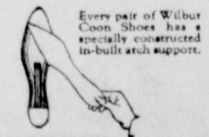
Every pair of Wilbur Coon Shoes has a specially constructed in-built arch support.

THAT'S what distinguishes Wilbur Coon from ordinary shoes.