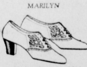
In black and tan glazed kid.

Wilbur Coon Shoes (Made-to-measure fit in ready-to-wear shoes)