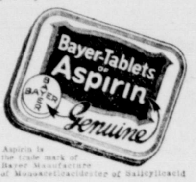
Aspirin is the trade mark of Bayer Manufacture of Monaceta-Aspirin of Dailysloacid

THERE is nothing quite like Bayer Aspirin for all sorts of aches and pains, but be sure it is genuine Bayer; that name must be on the package and on every tablet. Bayer is genuine, and the word genuine—in red—is on every box. You can't go wrong if you will just look at the box when you buy it.