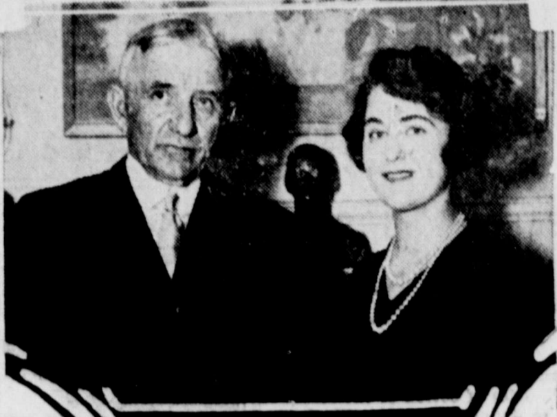
Miss Grace Moore with Governor Henry A. Horton of Tennessee held an informal tete-a-tete in New York while the governor was here on a short visit. Miss Moore will shortly make her debut at the Metropolitan Opera House.