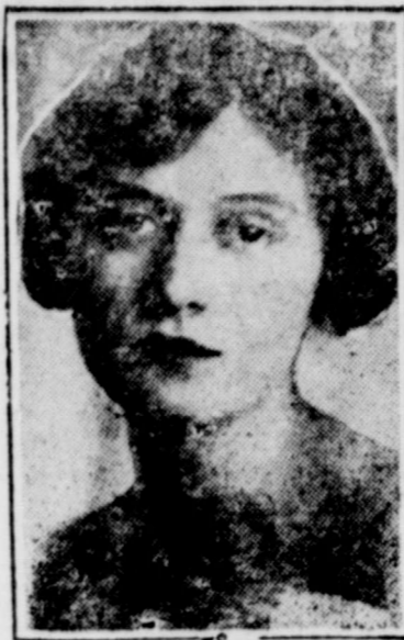
Princess Elizabeth LONDON, March 12.—Princess