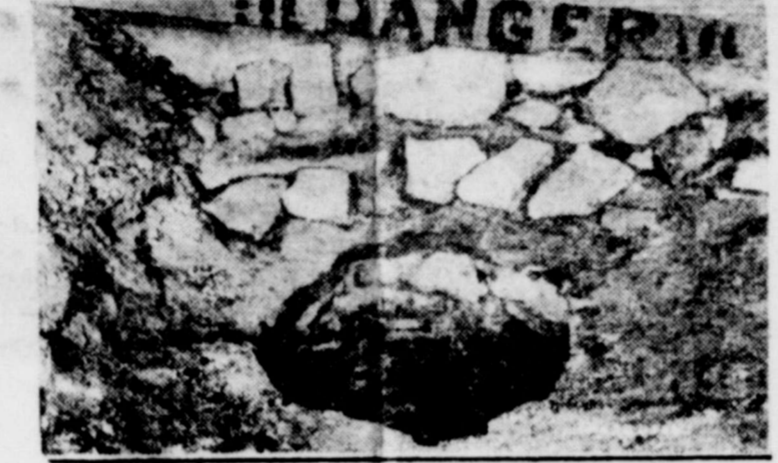
Above—THE OLD CASTLE AT FORT NIAGARA Below—OLD "GHOST WELL" AT FORT NIAGARA, N.Y.

(By Associated Press) BUFFALO, March 14. —A grim two century old stone guardian at the only occupied United States army post on the Canadian border is due to bear, before the year is ended, the flags of three great nations which have fought bloody battles over it.