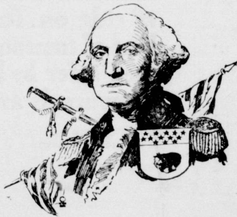
George Washington 1732 - 1799