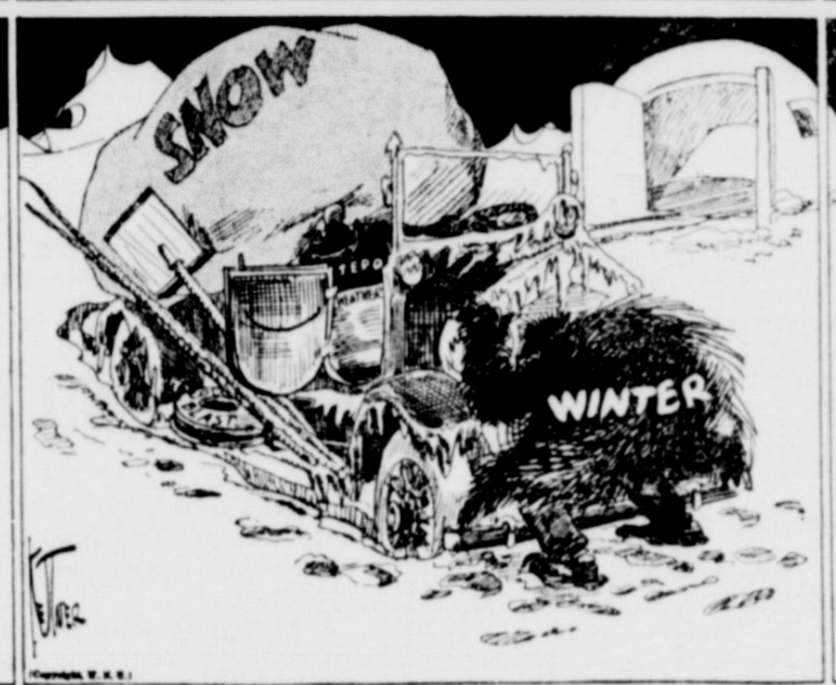
Starts On His Tour Through the States