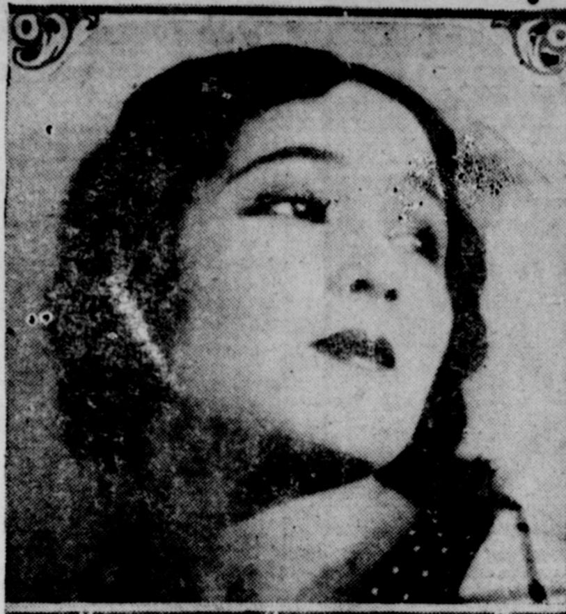
DOLORES DEL RIO WHO PLAYS CHAMPAINE IN THE FOX PRODUCTION "WHAT PRICE GLORY"