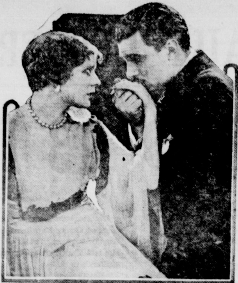
ALMA RUBENS and WALTER RIDGON IN FOX FILMS SUPREME ATTRACTION "MARRIAGE LICENSE?"

To have survived 10 forest fires in more than 200 years only to fall victim to the lumberman's axe was the fate of a fir tree in the Blackfoot Valley of Montana.