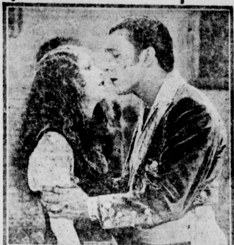
JOAN RENEE AND GEORGE O'BRIEN IN "THE SILVER TREASURE" A WILLIAM FOX SUPREME ATTRACTION

"Padlocked" is a story of paternal repression and its effect on a spoiled young girl of today. Lois Moran, the wistful heroine of "Stella Dallas," gives an inspired performance as the modern daughter, who braves the dangers and temptations of Broadway night life in pursuit of a dancing career. Noah Berry, as the old-fashioned father, whose zealous reform efforts drive his daughter from home, scores a distinct personal triumph in a very difficult role. Louise Dresser,