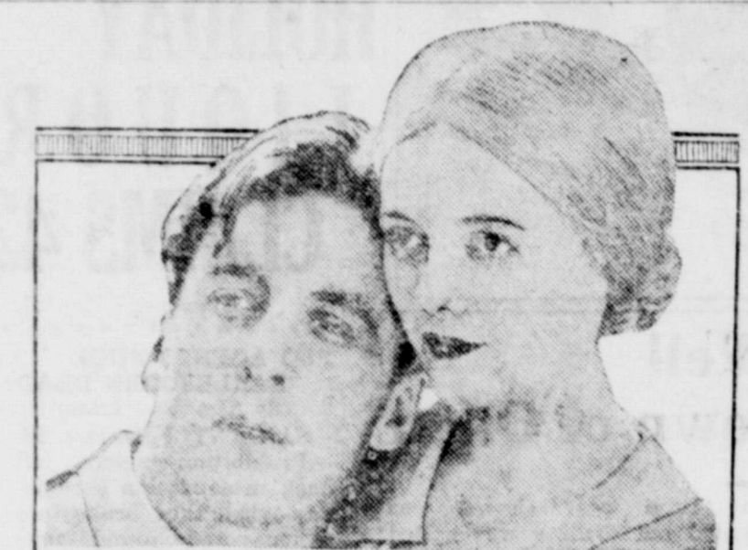
GEORGE OSWEN and JANET GAYNOR IN FOX PRODUCTION "SUNRISE"