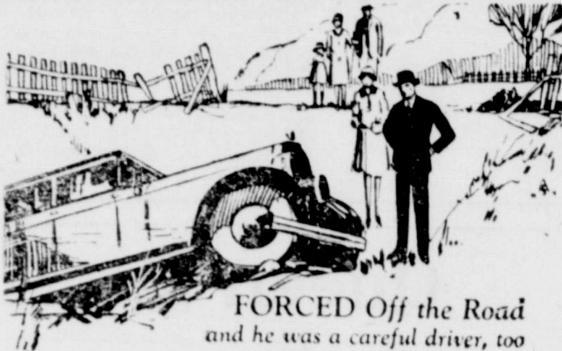
FORCED Off the Road and he was a careful driver, too

But one, a novice driver caused all the trouble, as is usually the case. A sharp curve—the other fellow hogging the road—you try to avoid a smash up and land in a ditch. It happens to the best of drivers—it may happen to you. Take out an accident insurance policy on your car to guard against such cases—be protected. "Insure and Be Sure."