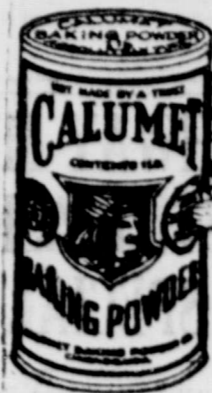
BEST BY TEST

If you want bakings that are perfect in taste and tenderness—that are pure and wholesome, use