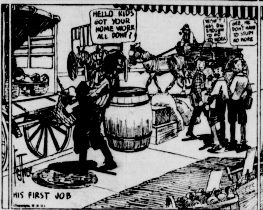
HIS FIRST JOB