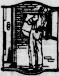
Outside Icing Convenience and 26 other Herrick features described in free book

The beating rays of the noonday sun mean nothing to the prize-winning Herrick.