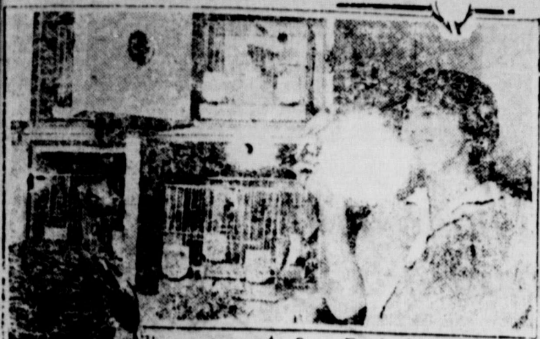
READY FOR AN ARIA

President of Montgomery Ward & Company. Its voice has been cultivated as sedulously as the prima donna's. "Canaries bred in the Hart mountains and the St. Andrews district of Saxony are selected by the Germans in voice culture, tone shading, and breath control like professional singers. The little vocalists go through a regular curriculum. A canary master singer that has proved a Carnegie selected to give the young birds singing lessons. "You the first year the birds are very busy practicing scales, with long arpeggios and perfecting their high register. Water devices like pipe organs are used to train them in flute notes. When the schooling is completed they are ready to be shipped to America. "The St. Andrews is regarded by experts as the best singer because of its wider range, softer voice and long roll. The Hart mountains roller makes a sharp sound. Maine was the only singer in the canary family. It is the only one that has been taught. With good care, the average canary lives about fifteen years. It will sing for at least ten years."