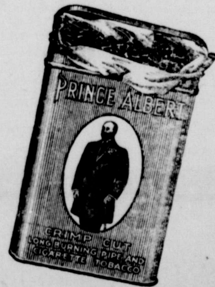
P. A. is sold everywhere in tidy red tins and toppy red bags. And always with every bit of bite and parch removed by the Prince Albert process.

P. A. is great in a jimmy-pipe too. As a matter of fact, many men who thought they never would like a pipe have switched to P. A. and are now pipe-regulars. Try Prince Albert both ways. Pipe or cigarette, it's just the mellowest, sweetest, most enjoyable smoke ever.