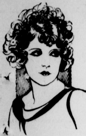
Viola Dana in the Paramount Picture "Forty Winks"