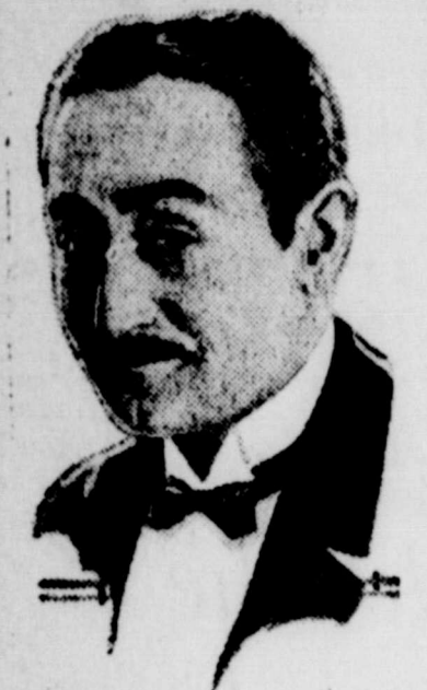
ADOLPHE MENJOU IN THE PARAMOUNT PICTURE "THE KING ON MAIN STREET"