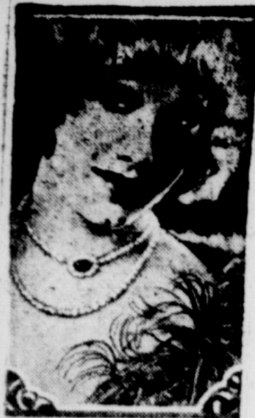
ESTHER RALSTON IN THE PARAMOUNT PICTURE "THE BEST PEOPLE"