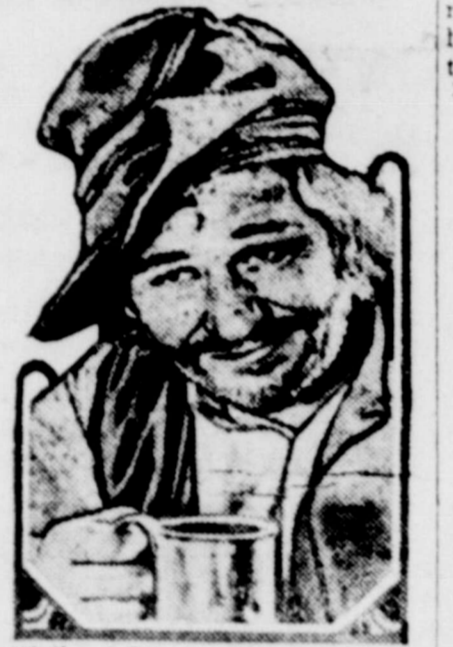
Wallace Beery in "The Sea Hawk"