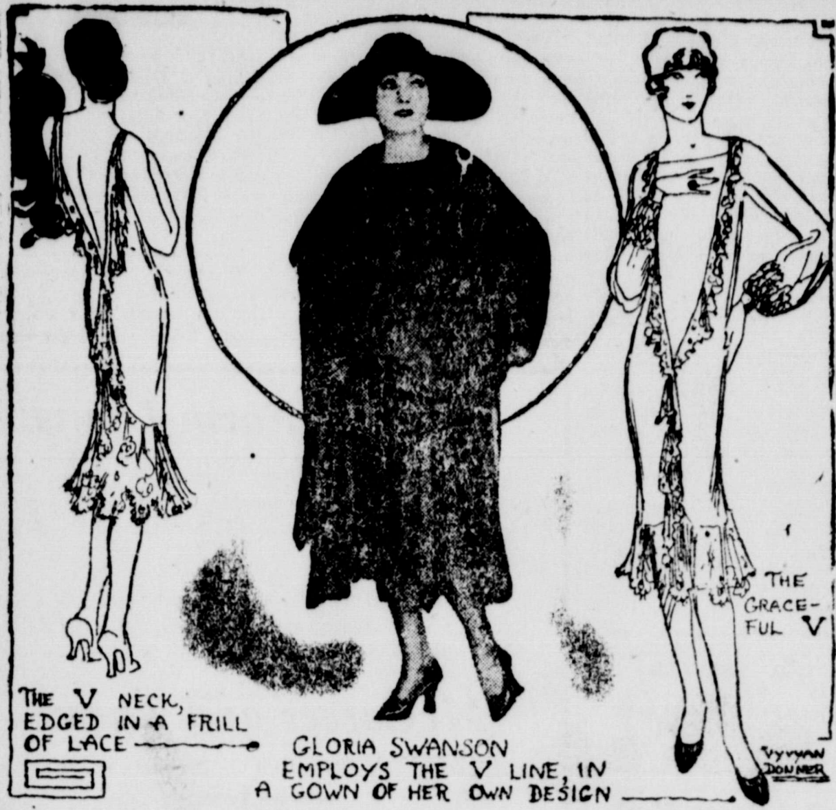
THE V NECK, EDGED IN A FRILL OF LACE