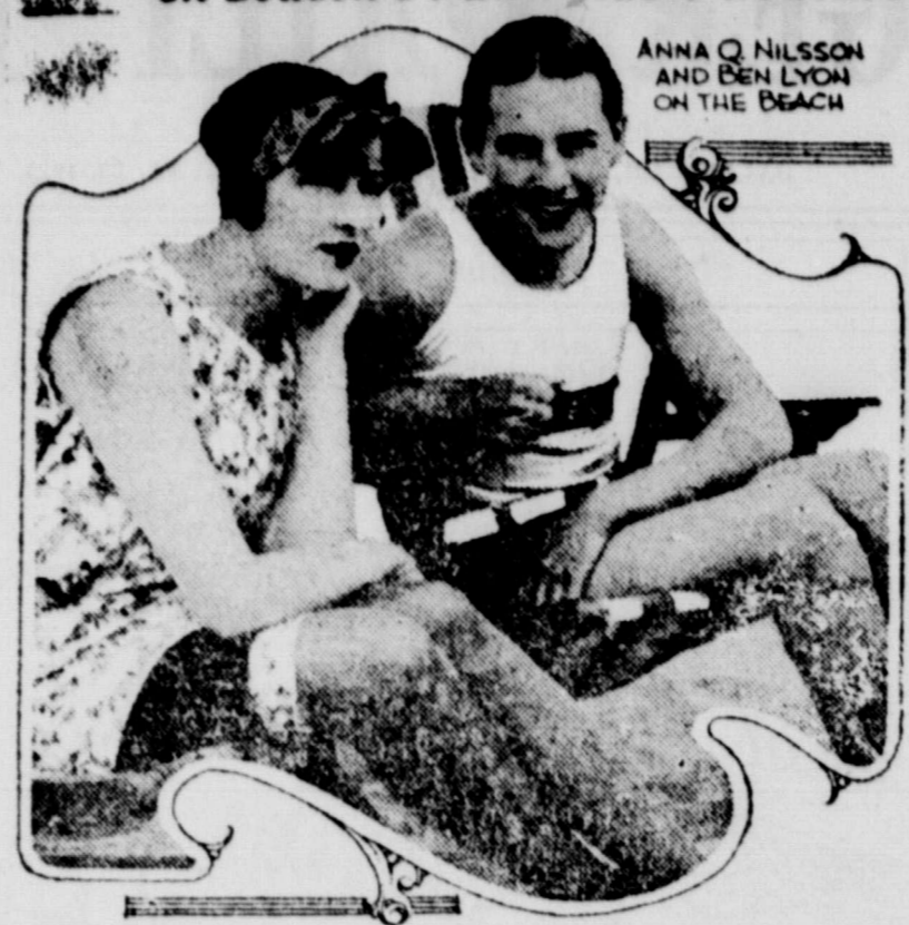
ANNA Q. NILSSON AND BEN LYON ON THE BEACH