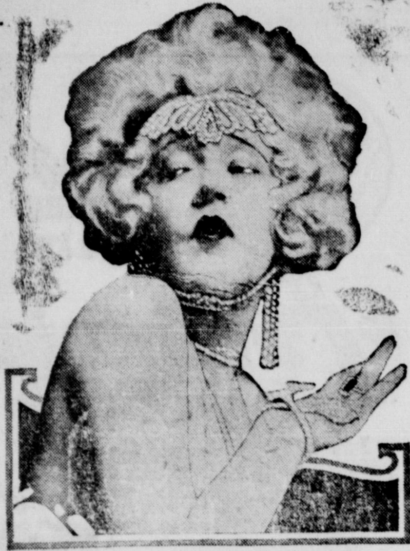
Mae Murray, whose twinkling toes give a new version of the famous Merry Widow Waltz in "The Merry Widow," her next screen vehicle

Star Gives Novel New Method for Keeping One's Figure Trim and Youthful.