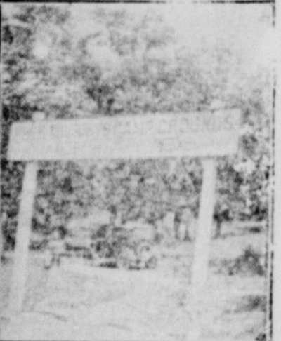
Entrance to the charming Beloit Tourist Camp, where more than 40,000 people camped last season. Almost every town or city in Texas now provides a camp for motor tourists. Motor Camper & Tourist.