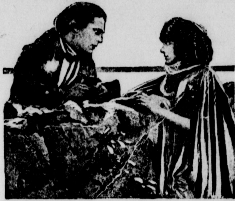
NEIL HAMILTON and CAROL DEMPSTER in D. W. GRIFFITH'S "AMERICA"