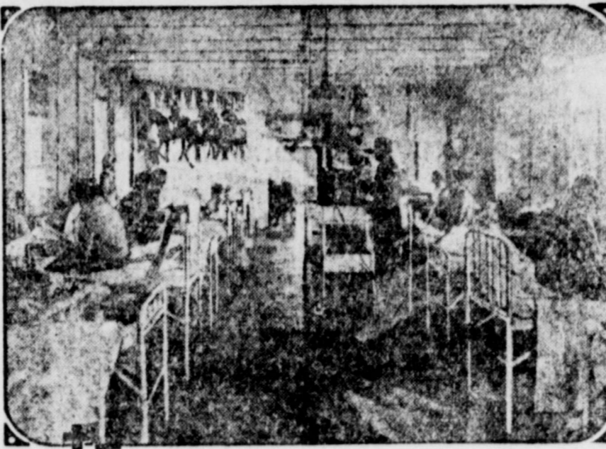
The American Red Cross conducts its recreational work in hospitals through trained men and women, introducing a multitude of recreations suited to the handicaps of the men. The accompanying view of a hospital ward shows in operation a moving picture projecting machine, developed by a Red Cross recreational director, which throws the pictures on the wall so that the men do not have to stir from their cots.

thousand people die in this country from tuberculosis. The affiliated organizations seek a fund of more than $6,500,000 to carry on the work through 1920. The money will be raised through the annual December sale of Red Cross Christmas Seals.