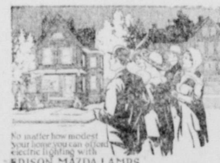
No matter how modest your home you can afford electric lighting with ADISON MAZDA LAMPS

Make your Home Attractive by its Lights It Won't Cost much and helps the looks of any home.