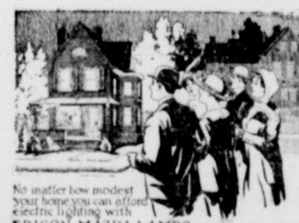
No matter how modest your home you can afford electric lighting with ADISON MÅZDA LAMPS

Make your Home Attractive by its Lights. It Won't Cost much and helps the looks of any home.