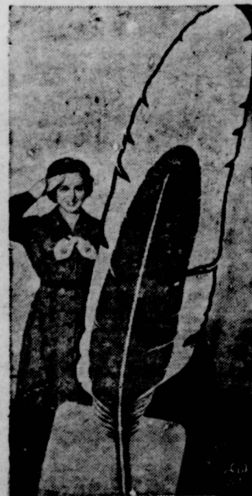
Girl Scouts all across the country salute the bigger Red Feather—symbol of the large scope of Community Chest activities made larger by the cooperation of all good citizens.