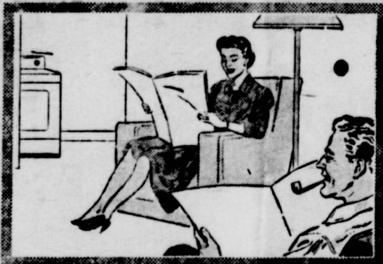
Instead of spending precious time at the clothesline, you just load and set your automatic Electric Dryer