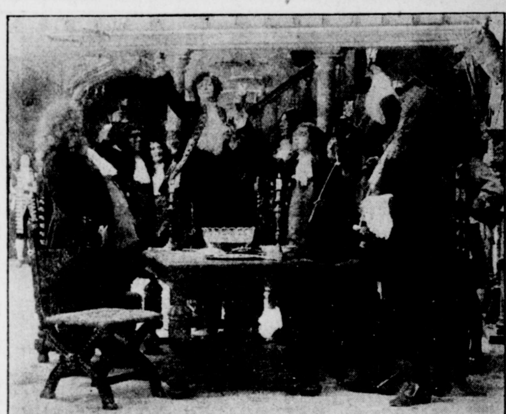
Scene from "A Lady of Quality" at Princess Theatre Tonight in Motion Pictures.