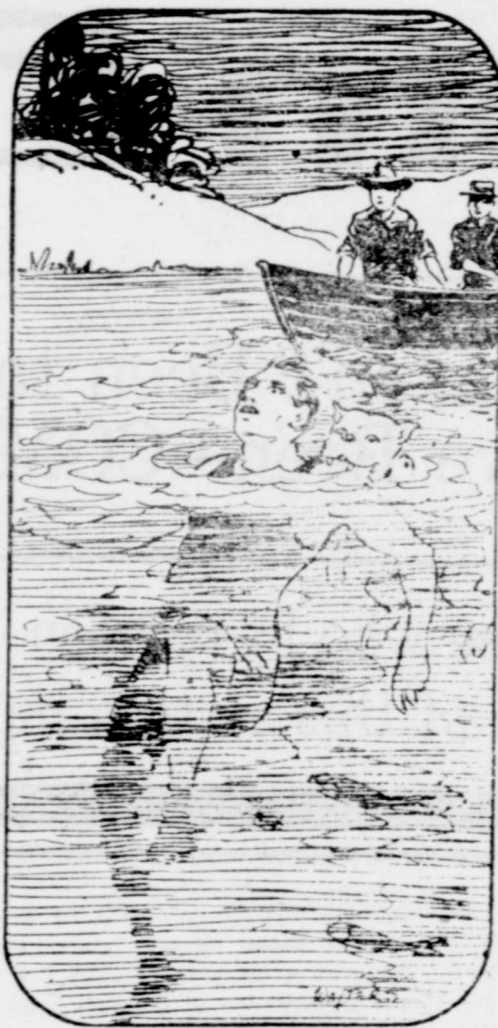
Grabbed Swimmer by the Shoulder.