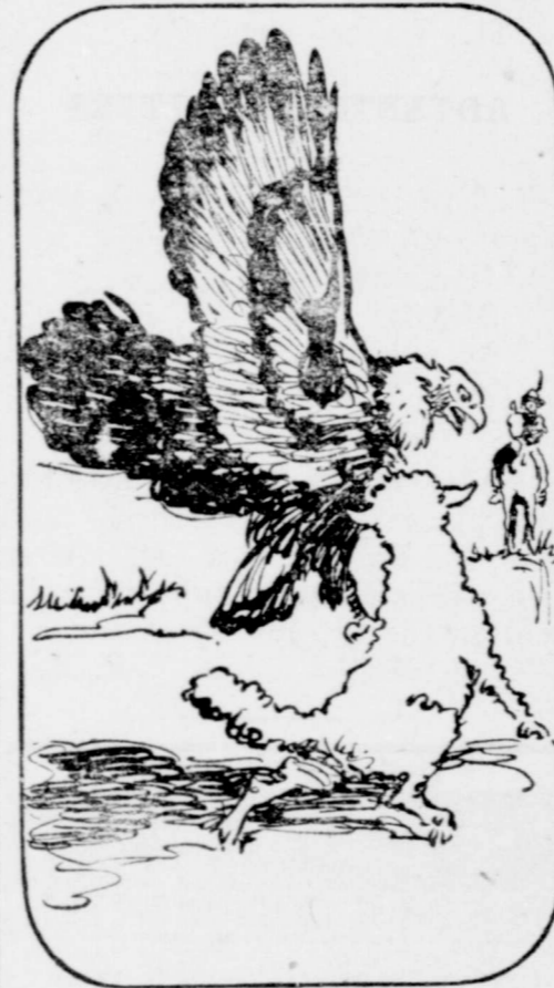
Could Not Disengage Its Feet.