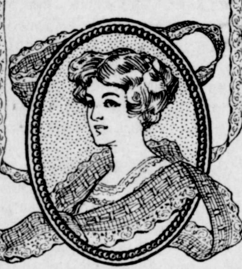
HIGGINBOTHAM - CURRIE WILLIAMS CO.

Shadow allovers for yokes and sleeves, dainty narrow edges and insertions, wide bands and sets for trimming.