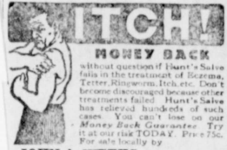
JOHN A. WEEKS

Statistics show that Lancashire owns and operates more than one-third of the whole of the cotton yarn producing machinery in the world. Shortly before the war she actually had too many spindles, having in a fit of optimism added twelve million of her equipment in the previous ten years. But today every spindle of her fifty-seven million is working at high pressure.