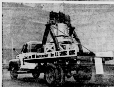
Pictured above is the full-size exact duplicate of the Liberty Bell which will be displayed locally and will tour the state as the symbol of the Independence Savings Bonds Drive from May 15 to July 4, which urges the people to "Save for your Independence."

Fifty-two of these bells, touring the nation during the drive, were completely donated by America's copper producers. Companies donating the Liberty Bells are the Anaconda Copper Corp.; Phelps-Dodge Corp.; American Smelting and Refining Co.; The American Metal Co. Ltd.; Miami Copper Co. The U. S. Steel Corp's American Bridge Company supplied the stays and hardware, used in mounting the bells. The Ford Motor Company is providing the transportation of these bells across the nation.