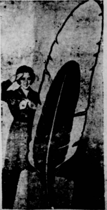
Girl Scouts all across the country salute the bigger Red Feather—symbol of the large scope of Community Chest activities made possible by the contributions of the people.

Changes Made Today At Carbon Eastland County, Texas Entered as second class matter at the Post Office at Carbon, Texas as under the act of Congress March 3rd 1879 W. M. Dunn, Publ