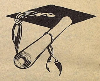
Buckle Up, Graduates It's Your Future

forth in their new world..."We want the best for you. We hope you seek the better things in life.